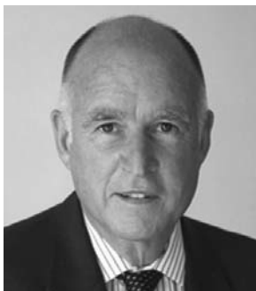
Governor Jerry Brown