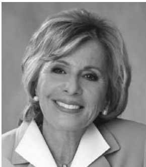
U.S. Senator Barbara Boxer